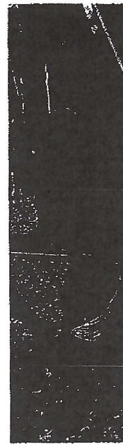
Plate 91 Dani tribe Timika, Indonesia.

Materialist theories have taken several forms. As the anthropological study of war first geared up in the 1960s, an influential school of thought argued that war, for all its destructiveness, somehow functioned to maintain a balance between local population numbers and environmental resources. In this ecological view, war led to relocations adjusting people to game or land availability, or to buffer zones where hunted animals replenished, or to reduced population growth, either through casualties or by valorizing male children and thus leading to selective female infanticide. With deeper examination, these adaptive functions were questioned. By the 1980s, cultural ecological approaches to war saw natural resource availability as important, but as only one set of variables, along with cultural, historical, and political factors. Some recent archaeological writings, however, suggest a return to a Malthusian perspective, with war portrayed as the regular result of growing populations pressing on